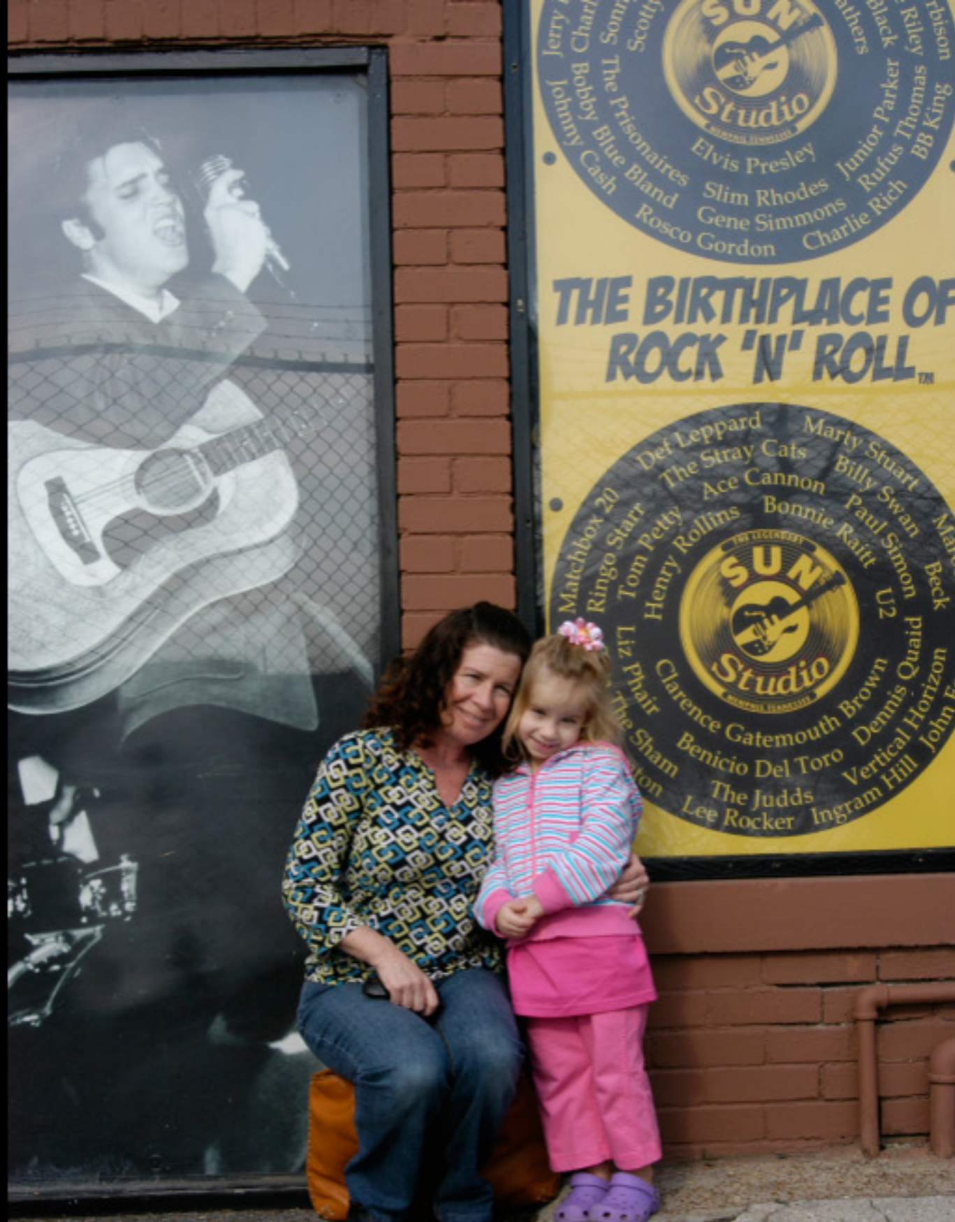
Sun Studios Memphis, TN